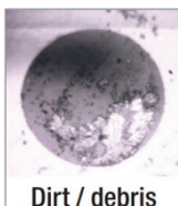
Dirt / debris

This transceiver is specified as ESD threshold 1kV for SFI pins and 2kV for all others electrical input pins, tested per MIL-STD-883G, Method 3015.4 /JESD22-A114-A (HBM). However, normal ESD precautions are still required during the handling of this module.